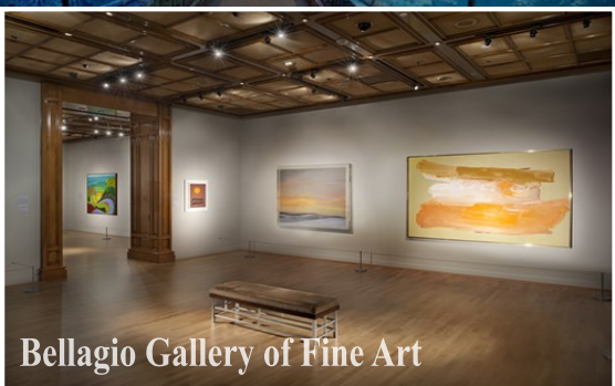
Bellagio Gallery of Fine Art